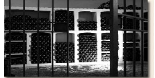
Pascal Bouchard's Cellars